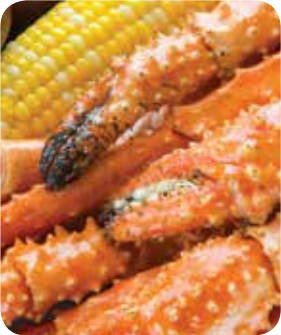
Crab Legs: Paddlefish