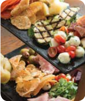
Antipasti Tower: Terralina Crafted Italian