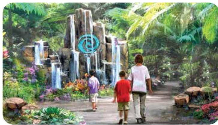
Artist concept only

While you are enjoying the stories, make sure to visit our Cardmember-exclusive Disney Character Experience at our private Cardmember location. 3, 5