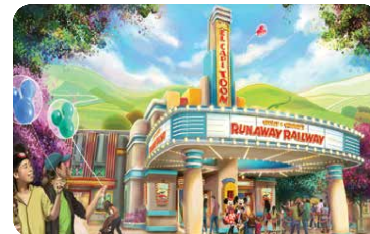
Artist concept only