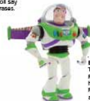
BUZZ LIGHTYEAR TALKING FIGURE Ready for blast-off! 12" tall Buzz has 15 phrases and sound effects. Features light-up, movable wings and laser lights.