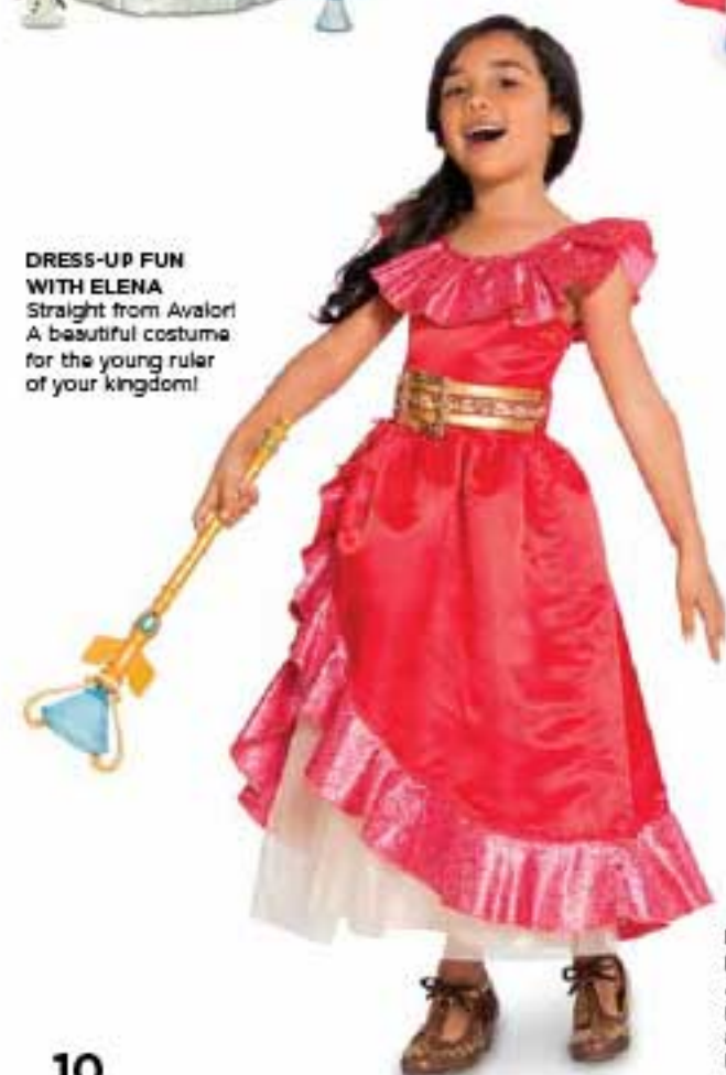
DRESS-UP FUN WITH ELENA Straight from Avalor! A beautiful costume for the young ruler of your kingdom!