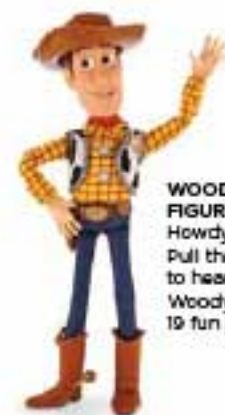
WOODY TALKING FIGURE Howdy, Partners! Pull the string to hear this 16" Woody doll say 19 fun phrases.