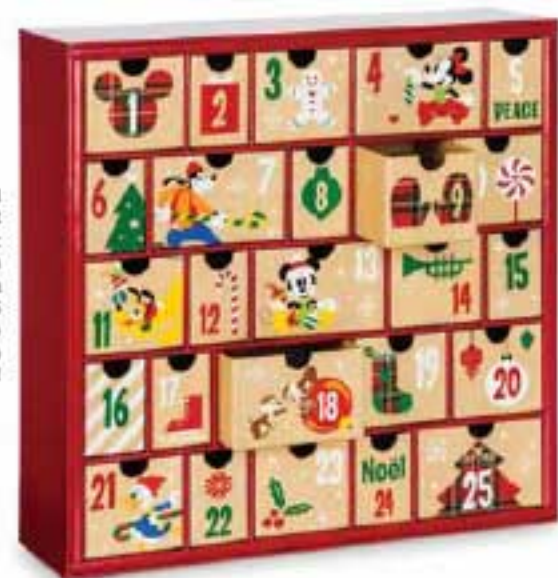
DISNEY TSUM TSUM ADVENT CALENDAR The cutest advent calendar ever! Everyone will love counting down to the holidays with 25 adorable mini Tsum Tsums. Sure to be a favorite!