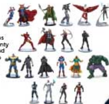
MARVEL MEGA FIGURINE SET Action adventures come to life! Twenty intricately detailed 5" figures include a mix of classic and new Marvel characters.