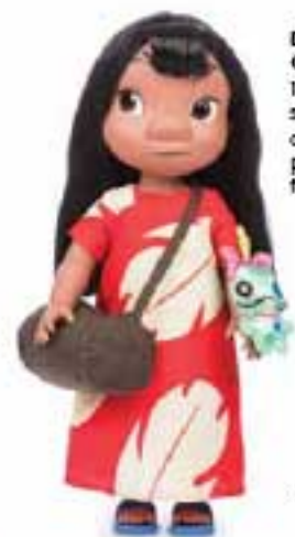
DISNEY ANIMATORS' COLLECTION LILO DOLL 16" Lilo wants to share the island spirit of Aloha with you. She is outfitted in her bold Hawaiian print dress and includes her best friend, Scrump.