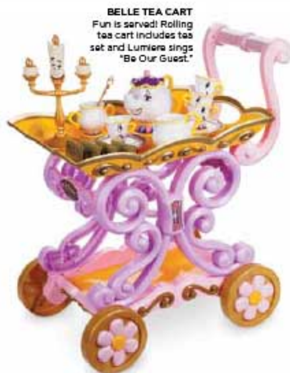
BELLE TEA CART Fun is served! Rolling tea cart includes tea set and Lumiere sings "Be Our Guest."