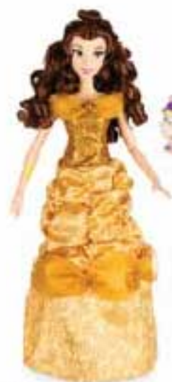
BELLE DELUXE INTERACTIVE DOLL A doll to cherish. Beautiful 17" Belle is dressed in a light-up gown that rotates. Includes Mrs. Potts, who sings "Tale as Old as Time."