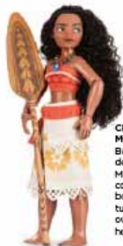
CLASSIC MOANA DOLL Beautifully detailed 11" Moana doll comes in a box that can be turned into an outrigger for hours of play.