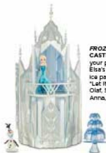
FROZEN ELSA ICE CASTLE Enchant your princess with Elsa's shimmering ice palace. Plays "Let It Go." Includes Olaf, Sven, Kristoff, Anna, Elsa and sleigh.

T his year, we're giving Santa a little assistance with a list of some of the best gifts at Disney Store and DisneyStore.com. Don't forget to use your Cardmember savings of 10% on select merchandise of $50 or more, and you'll have your holiday shopping all wrapped up!